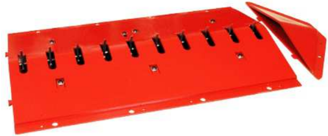
Surface Mount Traffic Spike