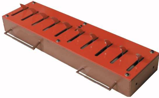
In Ground Traffic Spike