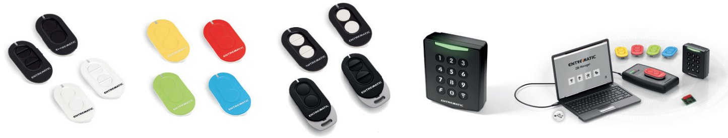
ZEN2 - ZEN4 - ZEN2W - ZEN4W

Remote controls: ZEN2, ZEN4, ZEN2W, ZEN4W, ZEN2Y, ZEN2R, ZEN2G, ZEN2B, ZEN2C, ZEN4C, ZEN2MT, ZEN4MT Digital radio keypad: AXK4