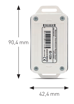
Wireless Tilt sensor Recommended for sectional doors and up-and-over doors