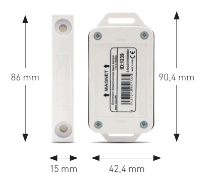
Wireless Magnetic sensor Recommended for sliding gates, swing gates, folding gates, side sectional doors, roller doors and swing doors