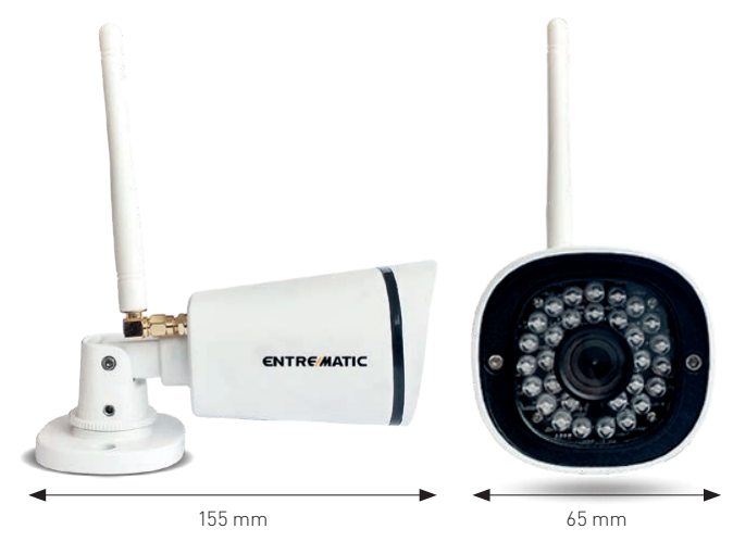
Indoor and Outdoor Camera Entrematic Smart Cam