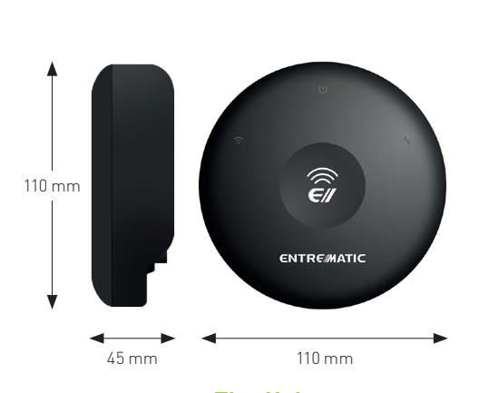
The Hub Entrematic Smart Connect Device