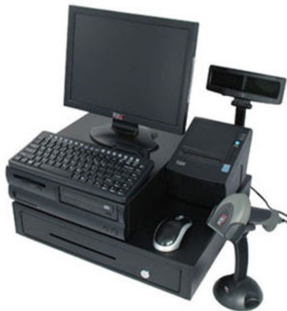
ALL-In-One Touchscreen solution